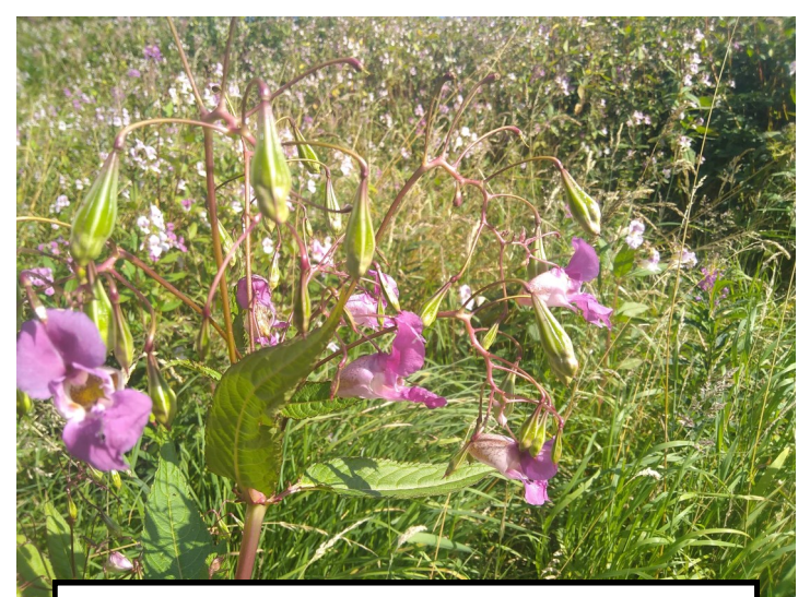
Himalayan Balsam which is widespread across Buxworth

clerk@chinleybuxworthbrownsidepc.gov.uk and we will be in touch next Spring with more details.