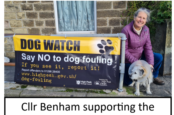
campaign on no dog fouling

I see my role as supporting our different community groups and helping Blackbrook residents where I can.