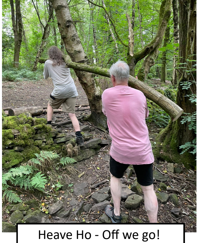
Reinforcing the path edges

As always the volunteers at Chinley Park Nature Reserve have been busy looking after this wonderful haven for thinning of vegetation in the pond. wildlife and the local community. Work on gravelling the paths has continued into the autumn and at our recent Work Party we continued to work on strengthening the path edges. Please keep to all paths as much as possible as this prevents erosion and damaging the wildflowers in the meadows.