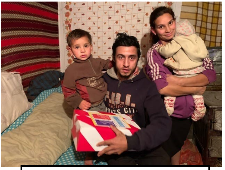
A family receiving a Shoebox

Link to Hope believe that sending shoeboxes shows love from British people to those in war-torn or poverty-stricken circumstances, regardless of their background, colour, creed or religion.